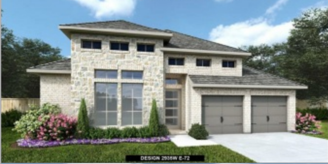
DESIGN 2935W E-72

Representative image. Features and specifications may vary by community.