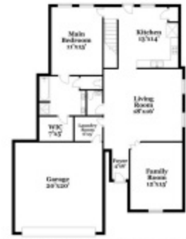
Disclaimer: The floor plan and stated dimensions in this illustration were as approximate measurements. Actual square footage and features may vary. Read terms and conditions for more detail. © PlotDeck