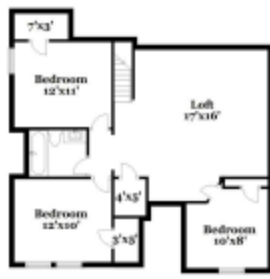
Disclaimer: The floor plan and stated dimensions in this illustration were as approximate measurements. Actual square footage and features may vary. Read terms and conditions for more detail. © PlotDeck