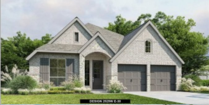
DESIGN 2529W E-30